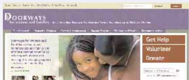
An example of The Matrix Group's excellent work. Check us out: DoorwaysVA.org !