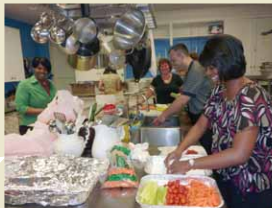
Volunteers from National Automobile Dealers Association preparing the meal for the April Dinner with Friends

Thank you To Metaphysical Church of Arlington, Junior League of Washington, National Automobile Dealers Association, NOVA Juniors, Alcova Heights Neighborhood, and Kiwanis of Arlington for providing current and former clients an opportunity to come together for a good meal and educational presentations!