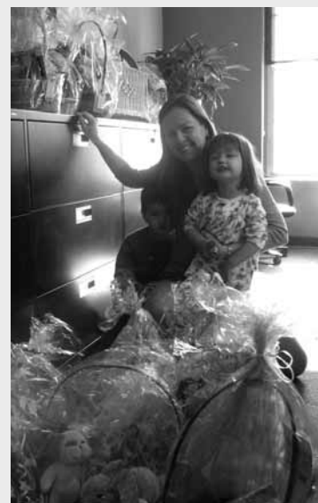
Floris UMC family delivers baskets for Doorways children.

Thank you to both organizations for their continued support of women and children in Arlington!