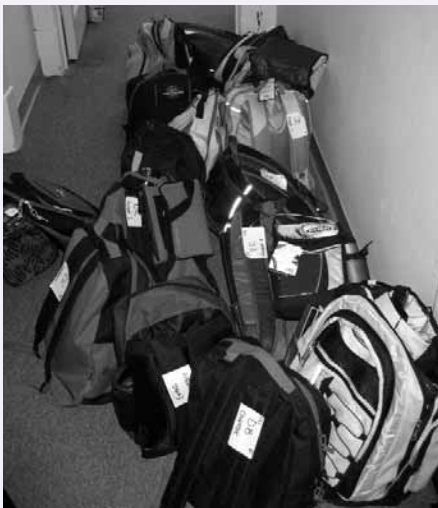
A few of the many backpacks provided for Doorways' children.

Each year Doorways conducts a Back to School drive to ensure all of the children in Doorways' programs have the necessary items they need to have a successful start to the new school year.