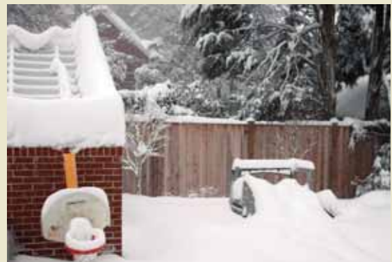
The backyard of the Family Home during the snowstorm

Staff scheduled to work over the weekend of the storm volunteered to begin their shifts several hours early to ensure they were able to get to the shelters then extended their stay to cover the three continuous days. Volunteers braved long lines at grocery stores to stock up on food, medications, and supplies on the day before the storm. Those who live within walking distance signed up to provide relief coverage for weekend staff as streets remained impassable to staff not already onsite. One of Doorways' Board members rallied the help of six neighborhood volunteers to remove over two feet of snow from our flat roof, ensuring the safety of our clients and staff. A well deserved Hip-Hip Hooray for these Superheroes of the 2010 Snowstorm!