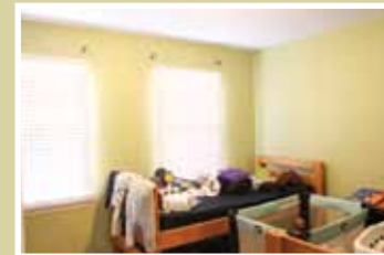
Upstairs Bedroom #2: houses a mother and up to 4 children