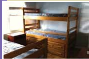
Upstairs Bedroom #1: houses a mother and up to 3 children