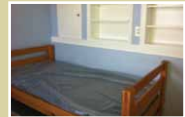
Downstairs Bedroom: houses a single woman or mother and one child