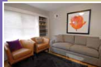
Living Room & Dining Room