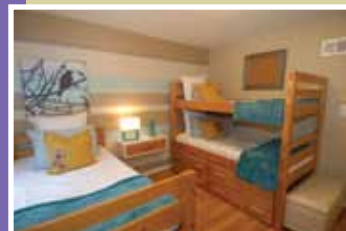
Upstairs Bedroom #1