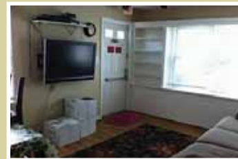
Living Room & Dining Room