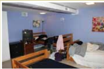
Downstairs Dorm Room: houses up to six single women